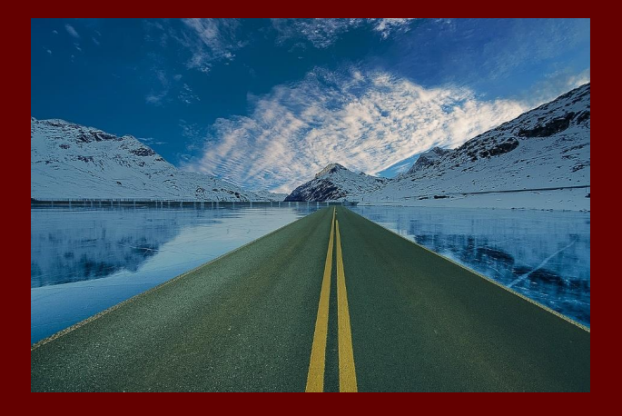
Strive to build people up and to glorify God!