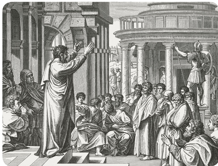
Paul in Athens by Raphael

Doesn't it seem that the disciples are constantly trying to block Jesus' road to the cross? They saw success and craved it. Who wouldn't? But what they saw as good was the opposite. Jesus knew that an earthly kingdom would be nothing without a payment for sin. So what seemed to be evil (the cross) was actually the highest good. And what seemed to be good (not being executed) was actually evil. It's hard for us to blame the disciples though. It's backwards to think that evil things (failure, disease, injustice, violence) might actually be the opposite.