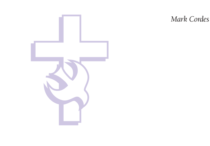
(Psalm 136 - refrain)