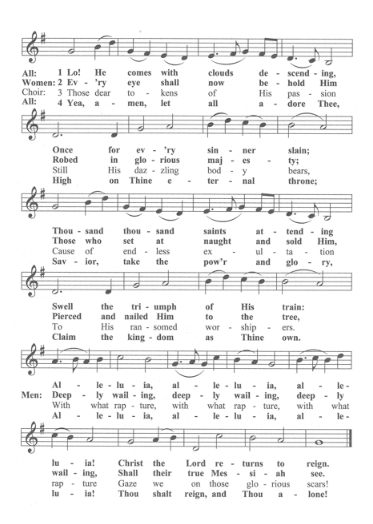
All text and music in the service folder is reprinted and reported under OneLicense.net #A-704382