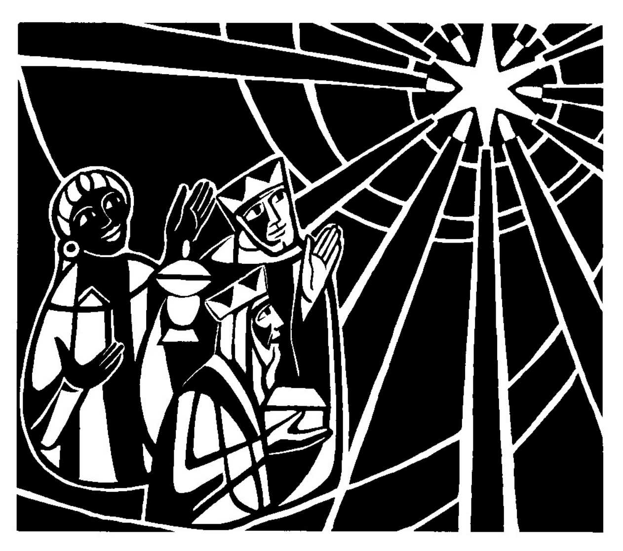
"After they had heard the king, they went on their way, and the star they had seen in the east went ahead of them until it stopped over the place where the child was." (Matthew 2:9)