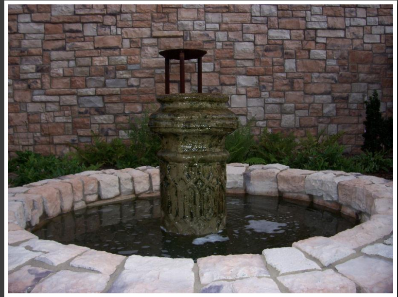
Site of the Easter Vigil opening