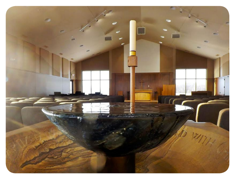
A living water font in a prominent location.

The suggestion was to place the font at the intersection of two axes: 1) the axis between the main entrance and multi-purpose space altar; and 2) the axis between the childcare center and a dedicated sanctuary to be built some time, and Lord willing, in the future. This concept shifted some rooms and moved some walls, but the placement of the font and subsequent building