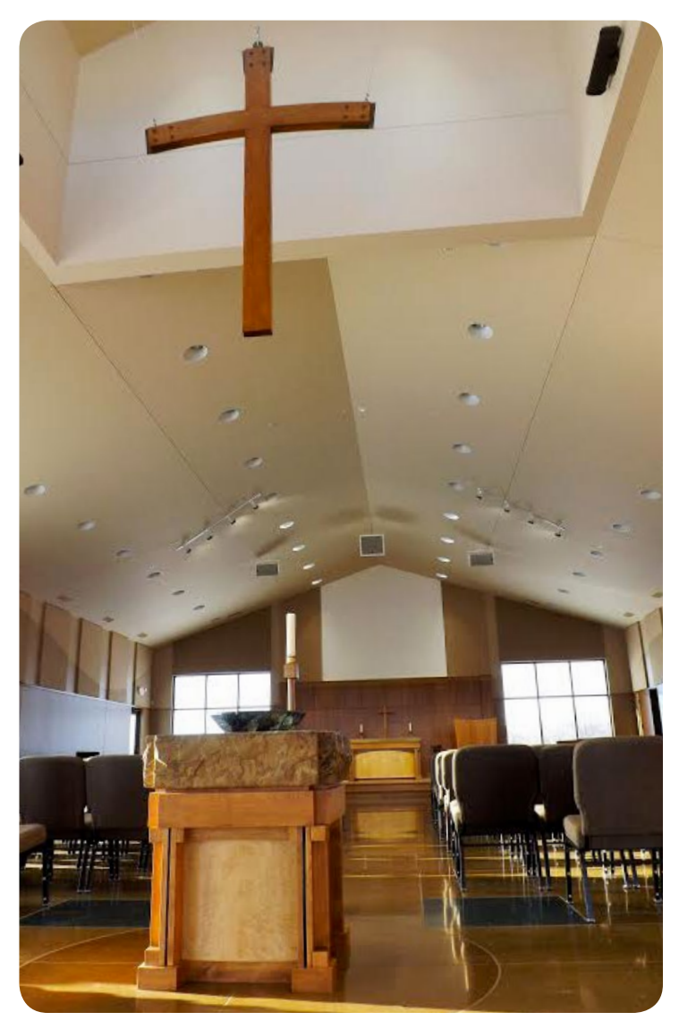
Baptism is at the heart of our mission and ministry.

In Hugo the dominant spiritual influence is a non-denominational church with Baptist roots. This multi-campus mega-church welcomes thousands on a Sunday yet downplays the gospel in Word and sacrament. We knew early on that our confessional stance on the Means of Grace would make us distinctive in the community. We knew that we had a remarkable opportunity for future baptisms through the childcare center, and we wanted a living water font in a prominent location. The design came together when our liturgical consultants suggested a particular