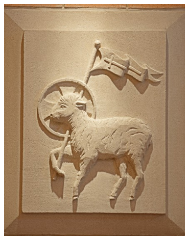
Spotlight on one of the Trinity stone reliefs.

Small spotlights were also installed which highlight three stone reliefs symbolizing the Trinity on the east wall of the sanctuary. Cove lighting along the sanctuary perimeter provided additional warmth to the worship setting. An easy-to-use control panel made lighting entirely dimmable. This panel makes it possible to set up a variety of lighting levels for the sanctuary as well as to focus spot lighting on select areas. This has enabled us to have a variety of lighting schemes for special services such as Tenebrae on Good Friday and Candlelight Services on Christmas Eve.