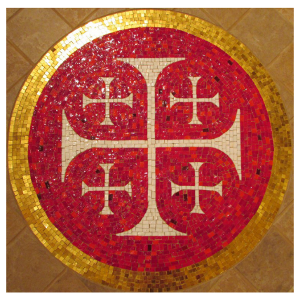
Jerusalem cross for Jerusalem church.