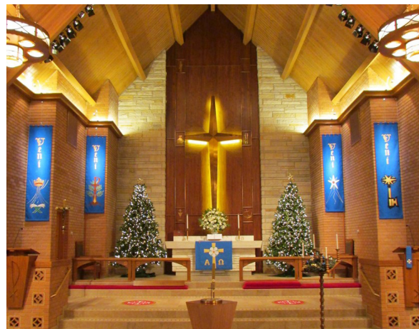
Spotlights highlight advent banners.

This second phase of renovation commenced in the summer of 2009 and included new sanctuary flooring. The red aisle carpeting was completely removed along with the crumbling asbestos floor tile under the pews. In its place ceramic tile was laid, with different colors and sizes for the aisles (large gray tile) and under the pews (standard cream-color tile). A checkered border between the tile added aesthetic interest, as did a mosaic of the Luther Rose near the entry.