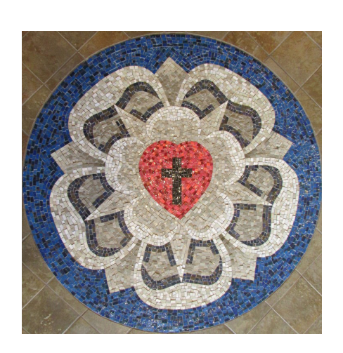
Luther Rose mosaic invites questions.

This second phase of renovation commenced in the summer of 2009 and included new sanctuary flooring. The red aisle carpeting was completely removed along with the crumbling asbestos floor tile under the pews. In its place ceramic tile was laid, with different colors and sizes for the aisles (large gray tile) and under the pews (standard cream-color tile). A checkered border between the tile added aesthetic interest, as did a mosaic of the Luther Rose near the entry.