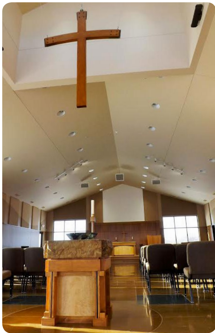
Baptism is at the heart of our mission and ministry.

In Hugo the dominant spiritual influence is a non-denominational church with Baptist roots. This multi-campus mega-church welcomes thousands on a Sunday yet downplays the gospel in Word and sacrament. We knew early on that our confessional stance on the Means of Grace would make us distinctive in the community. We knew that we had a remarkable opportunity for future baptisms through the childcare center, and we wanted a living water font in a prominent location. The design came together when our liturgical consultants suggested a particular