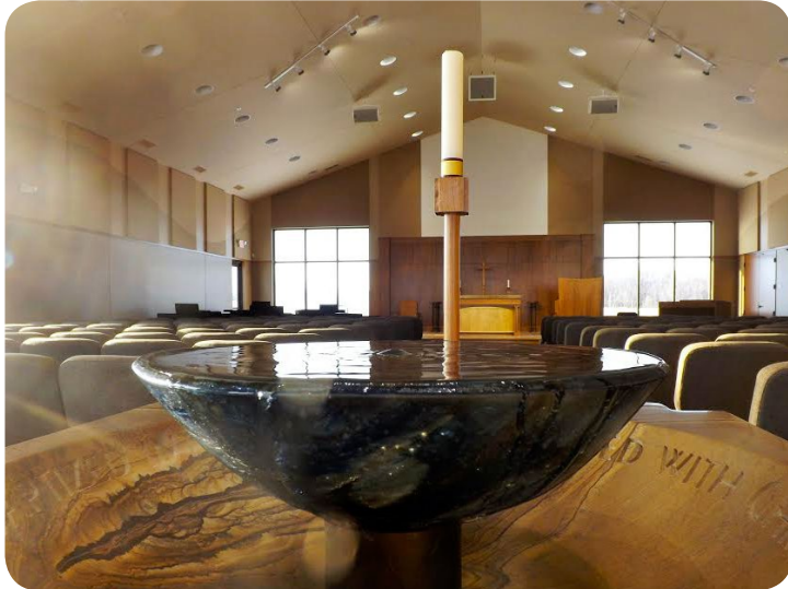
A living water font in a prominent location.

The suggestion was to place the font at the intersection of two axes: 1) the axis between the main entrance and multi-purpose space altar; and 2) the axis between the childcare center and a dedicated sanctuary to be built some time, and Lord willing, in the future. This concept shifted some rooms and moved some walls, but the placement of the font and subsequent building