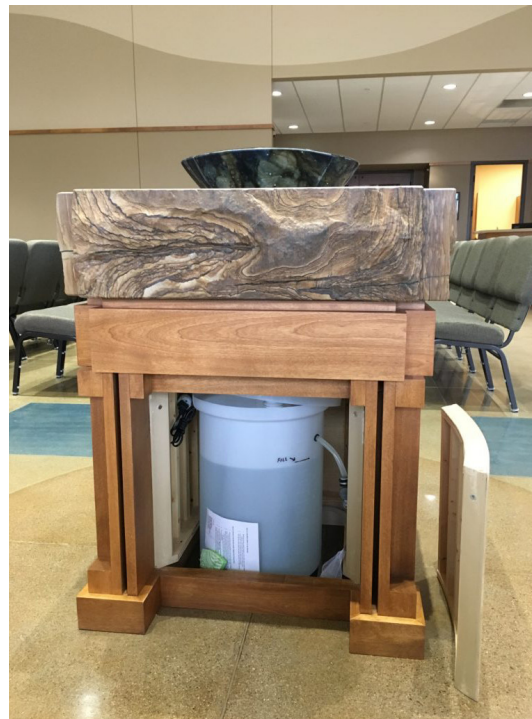
Inner workings of font