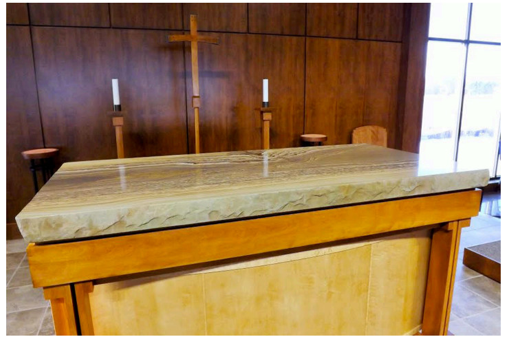
Altar with sandalwood stone top