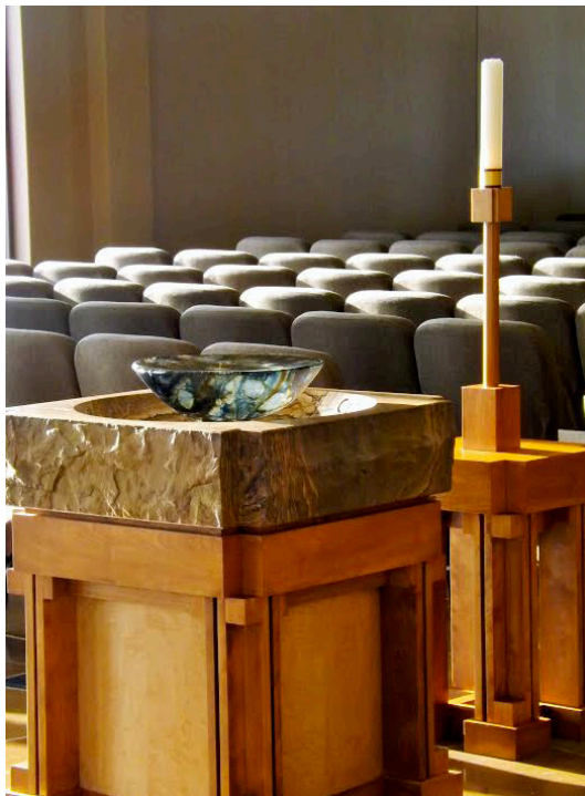
Font and Paschal Candle