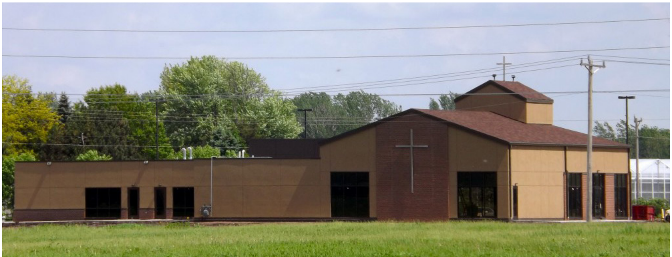
Exterior pictures of the new facility.