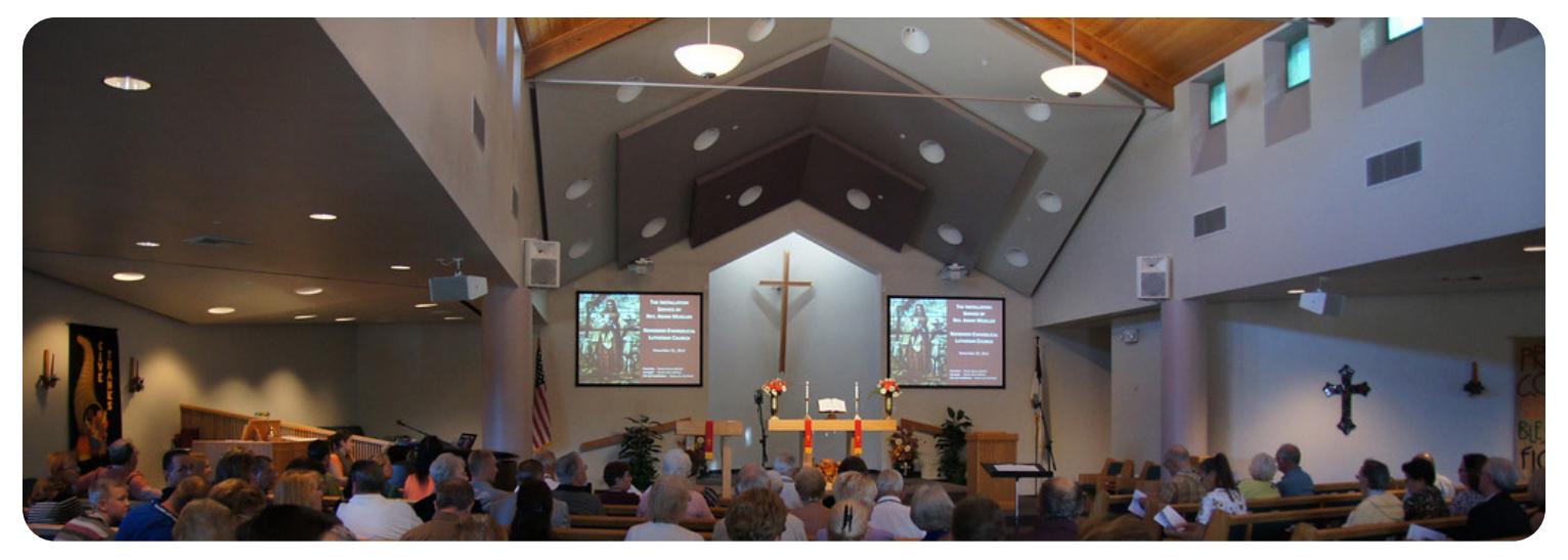
Before: digital displays too dominant in the chancel.