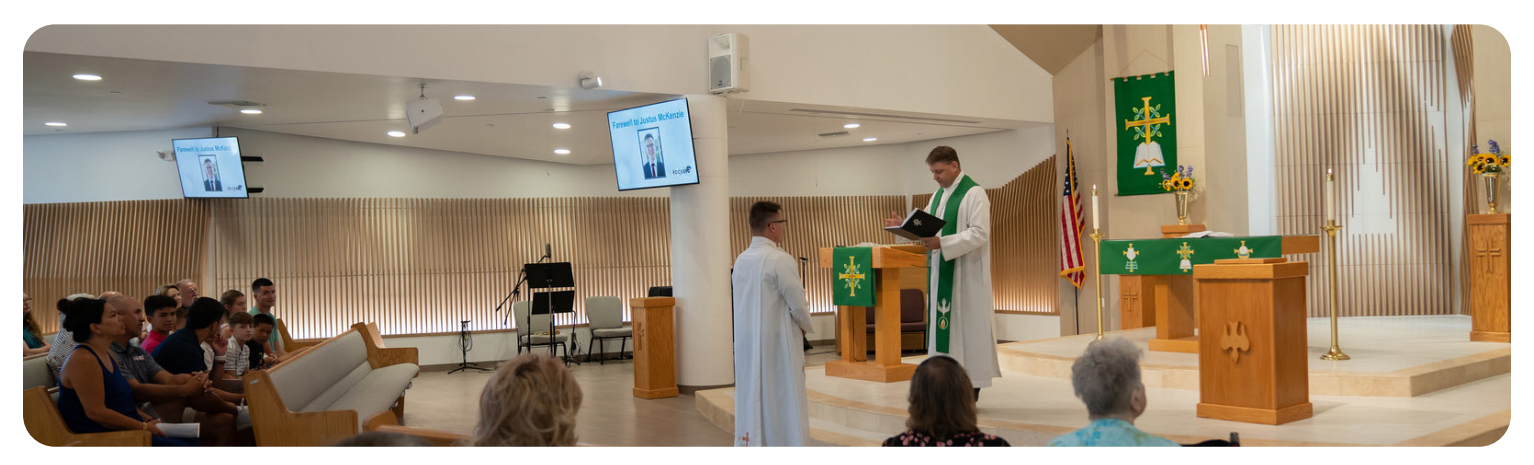
After: digital displays positioned outside the chancel, a pair on each side.