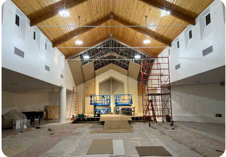
Demolition precedes new beauty.