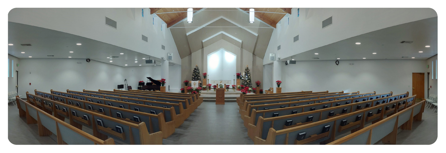
Wide angle panoramic view before addition of the cross and wood slats.

around the whole chapel via the wood slats, indicating his gospel call and his gentle shepherding of those who gather around the Word."