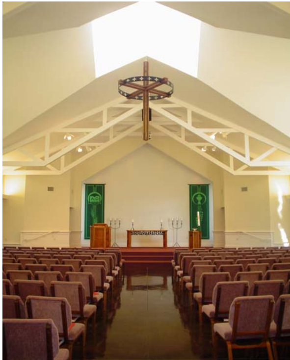
The beautiful and simple design of the interior