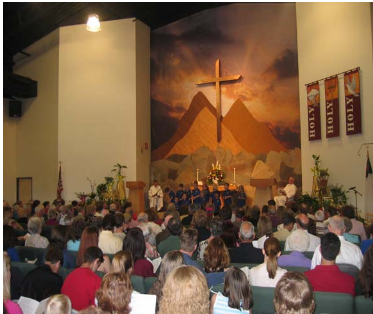
Christmas service at Cross of Glory

This content supplements WTL #18, March, 2006.