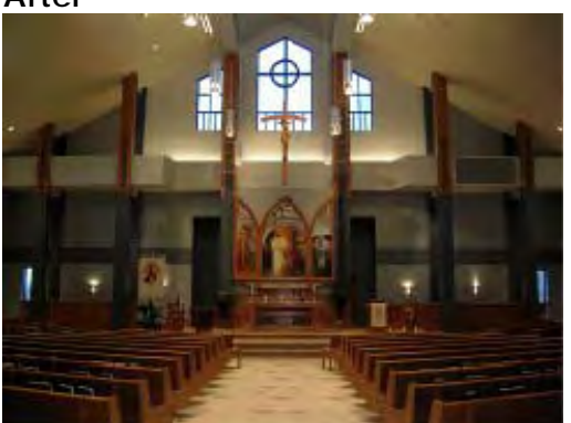
The peak of our roof is 44' high. The side walls are also high.