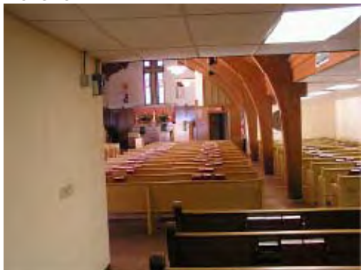
View from the "penalty box."