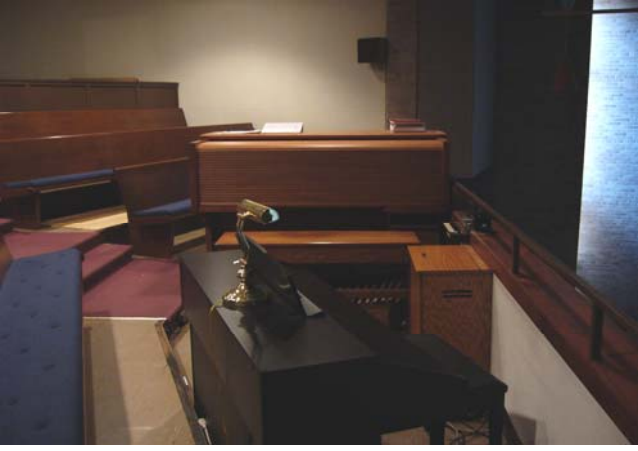
Organ console, piano, filing cabinet. This photo is not a deliberate attempt to make the old design look bad. It really was terribly crowded.