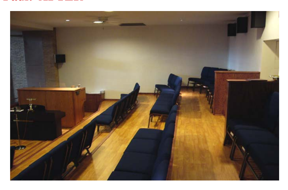
"orchestra pit" in front, movable seating, improved lighting, 50% more space with organ casework removed